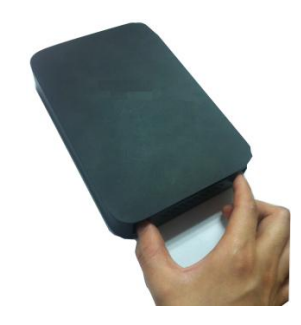
① Draw out the HDD bracket